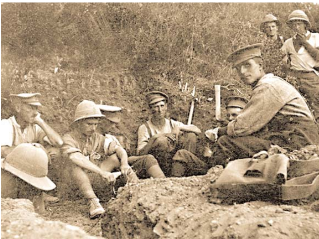
National Library of New Zealand F58131

Photograph of New Zealand soldiers resting in a trench during their assault towards Chunuk Bair on the night of 6 August 1915.