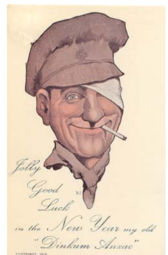
NAA Item 3740 A1801/1